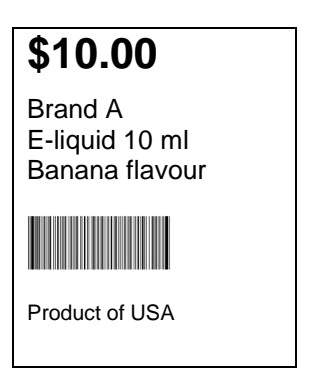
Figure 6: Example of a compliant e-cigarette product price ticket

For example, to comply with product line display restrictions, you cannot display different volume bottles of the same brand and flavour. If you decided to display the 30-millilitre bottle, you could use price tickets to hide all the other bottles in the same product line.