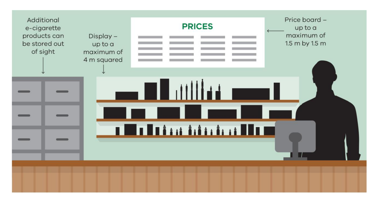
Figure 3: Example of a compliant display of e-cigarette products

You can use price tickets and price boards to inform customers about the blocked products.