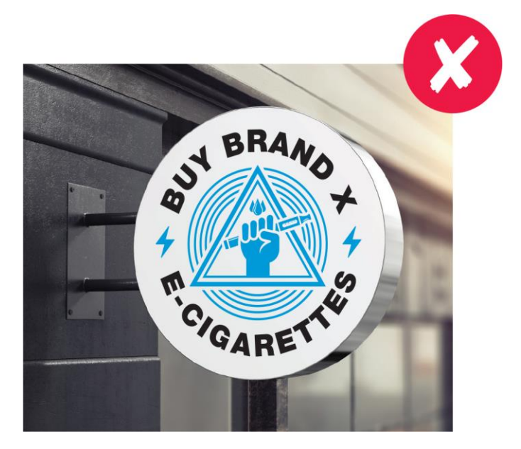
Figure 7: Examples of prohibited e-cigarette advertising