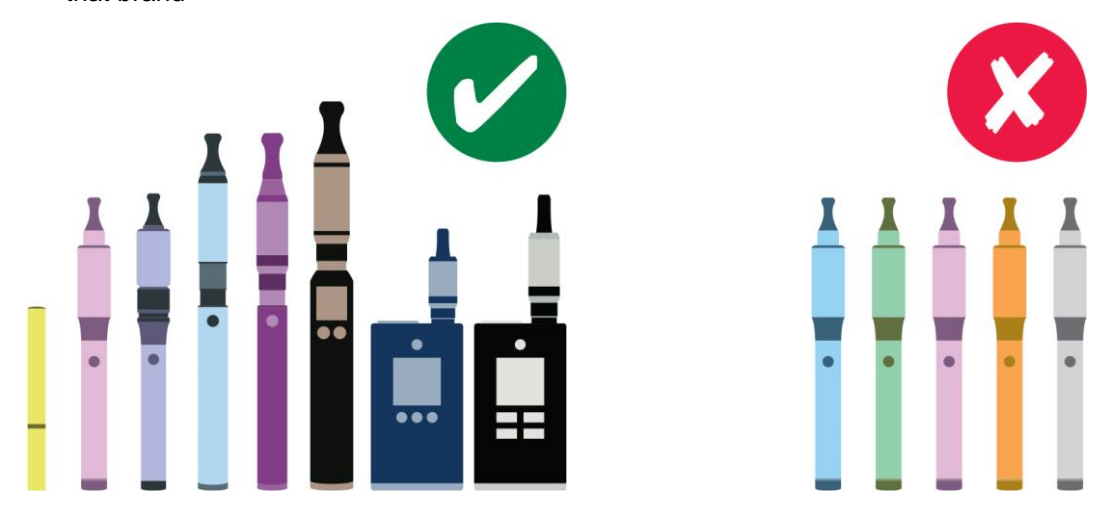
Figure 1: Example of compliant and non-compliant display of e-cigarette device product lines

Brands available with different features such as colour or wattage: one device may be displayed of that brand