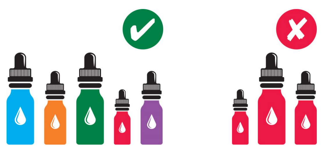
Figure 2: Example of compliant and non-compliant display of e-liquid product lines

Note: The right-hand side of this diagram shows the same flavour of e-liquid in different sizes.