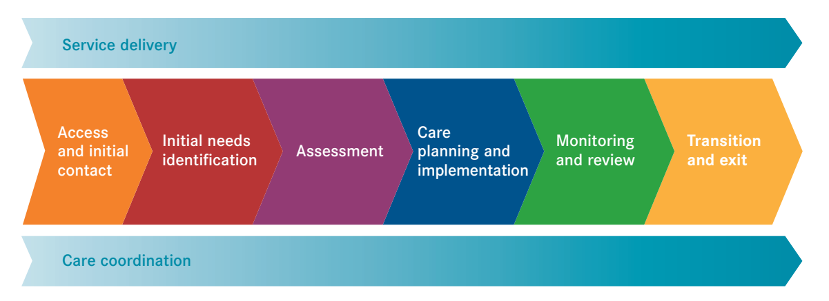
Figure 1: Health independence programs model of care

The health independence programs model of care outlined in the service delivery section of the guidelines is conceptualised in terms derived from the Victorian service coordination practice manual . The health independence programs model of care is illustrated in Figure 1.